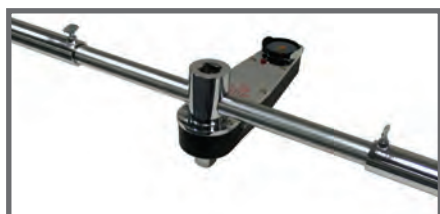
T-TYPE DIAL WRENCHES must be operated by two persons or a torque multiplier. The handle is over 10 ft.long.